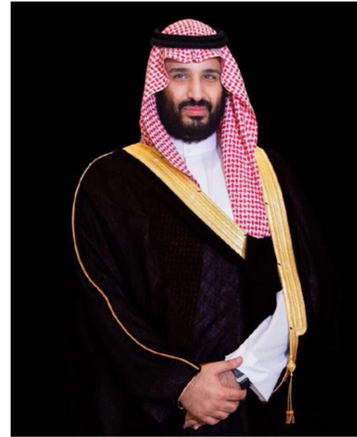
HIS ROYAL HIGHNESS PRINCE MOHAMMED IBN SALMAN IBN ABD AL-AZIZ AL S'AUD

Crown Prince, Deputy Premier, and Minister of Defense