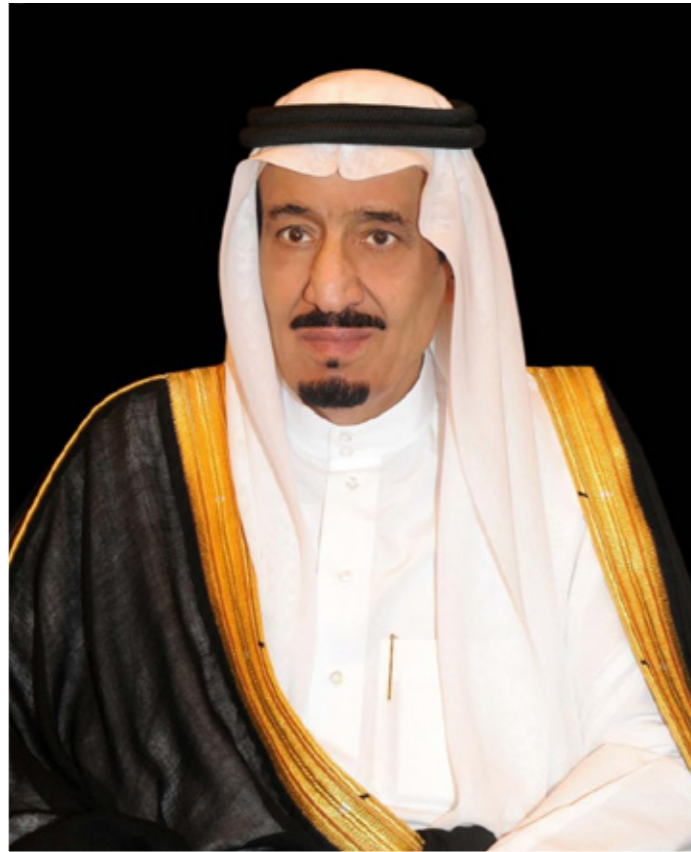
KING SALMAN IBN ABD AL-AZIZ AL S'AUD